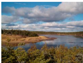
La Croix River

Artists are welcome to join the festivities! Email to register!!!