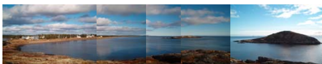
Panoramic view of Chevery West